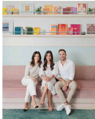
SHOU SUGI BAN HOUSE